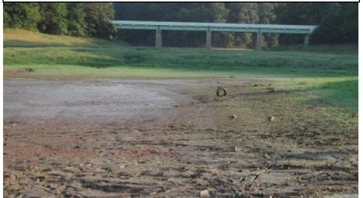
Drought Conditions, Pretty Boy Reservoir, Baltimore County

The forum will feature experts and decision makers who manage and protect groundwater resources in Maryland. Topics will include sustainability, alternative sources, and the challenges of population growth and climate change.